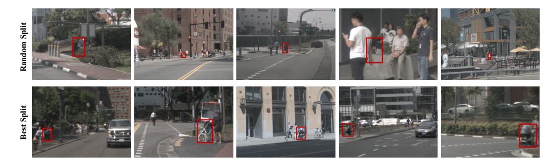
Figure 4: Visualizing Random and Best Split. In the top row, we visualize the 5-shot training examples of strollers from a random split . Similarly, we visualize the 5-shot training examples from the best split in the bottom row. We observe that strollers in the random split are often occluded, small in size and blurry, making few-shot learning harder. On the other hand, the best split examples are larger, have better visual quality and are relatively un-occluded. This visual difference directly translates into better few-shot performance. We achieve 13.09 Stroller AP for the random split and 18.54 Stroller AP for the best split . We show a more comprehensive evaluation in Table 5.

Despite using VLMs pre-trained on large-scale datasets, we find that performance for rare categories (defined by the cardinality of each class in the original dataset) is considerably lower than for common