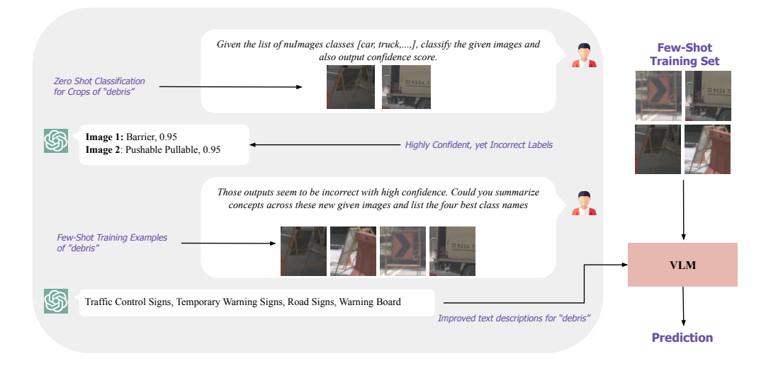
Figure 3: Iteratively Prompting ChatGPT. Despite its large-scale pre-training, multi-modal models like ChatGPT-40 also suffers from concept misalignment. Specifically, GPT-40 makes highly confident but incorrect predictions for debris. We propose an iterative prompting strategy to better align the model to a target concept. Given a few visual examples per-class from the training-set, we query ChatGPT to use its "web-scale knowledge" to generate text descriptions. We then augment the input to MQDet to incorporate this additional context for zero-shot evaluation.

CVPR 2024 Challenge . Our inaugural Foundational FSOD competition (hosted on Eval AI) received submissions from seven teams (some submissions are private). We present a ranked list of participants at the close of our competition on June 7th 2024 AOE in Table 4. Notably, three teams beat our baselines, with the winning team achieving 45.35 AP! Unfortunately, the top performing team was not willing to publicly share details about their method. We summarize contributions from the other two top teams below.